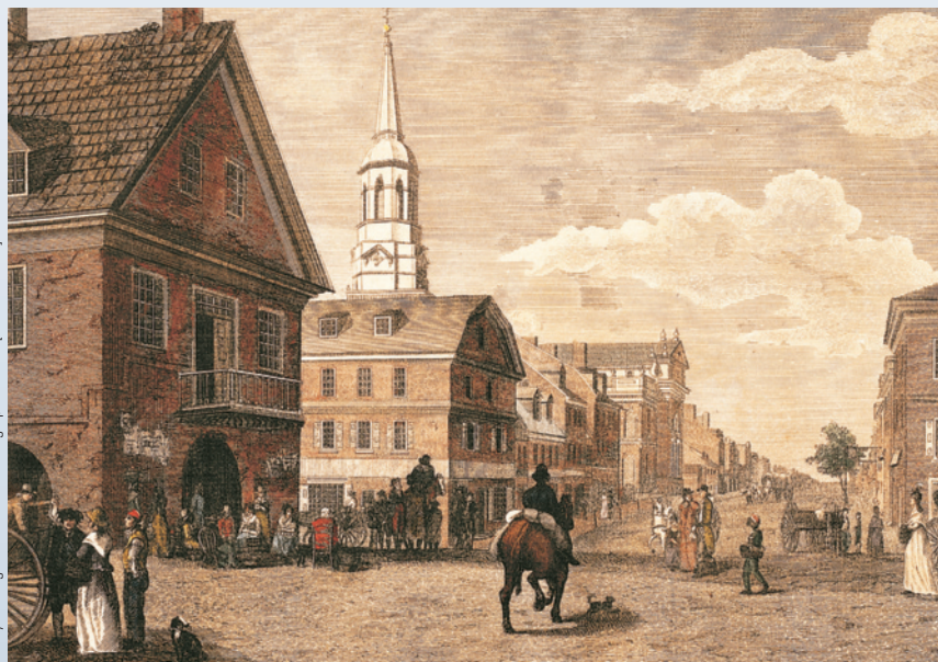
Library of Congress Prints and Photographs Division [C-USZC4-554]

Eight years of revolutionary war did more than anything in the colonial past to bring Americans together as a nation. Comradeship-in-arms and the struggle to shape a national government forced Americans to subdue their differences as best they could. But the spirit of national unity was hardly universal. One in five colonists sided with the British as “Loyalists,” and a generation would pass before the wounds of this first American “civil war” fully healed. Yet in the end, Americans won the Revolution, with no small measure of help from the French, because in every colony people shared a firm belief that they were fighting for the “unalienable rights” of “life, liberty, and the pursuit of happiness,” in the words of Thomas Jefferson’s magnificent Declaration of Independence. Almost two hundred years of living a new life had prepared Americans to found a new nation.